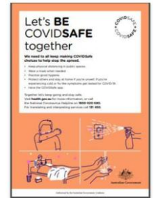
Living the new normal