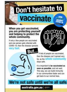
Don't hesitate to vaccinate