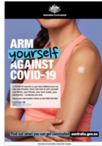
Arm yourself poster