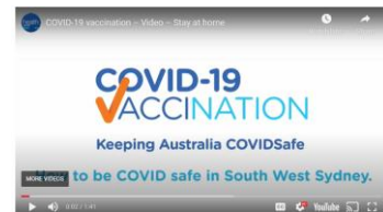
Stay Home during Sydney outbreak